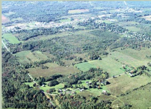
300-acre Greenfield development site