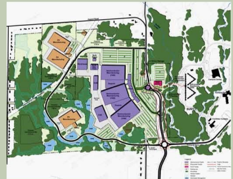
300-acre full build-out campus