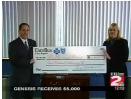
Excellus BlueCross BlueShield is just one of many community supporters