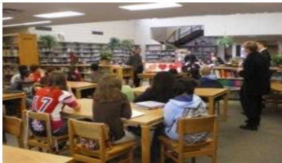
Career Exploration Programs sponsored by Genesis