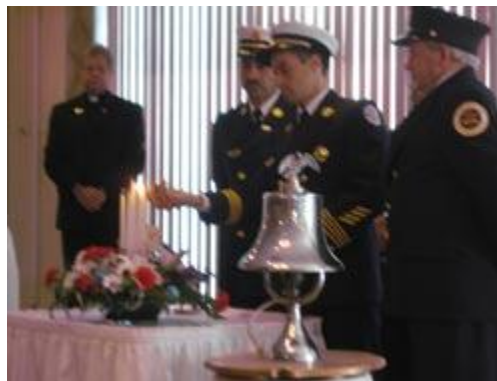
Regional Prayer Breakfast sponsored by Genesis